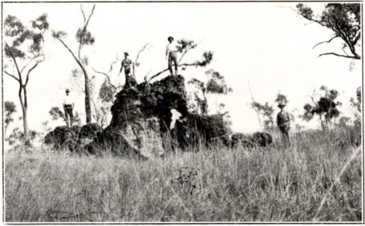
NIGHTFLOWER SILVER-LEAD LODE, MAIN OUTCROP.