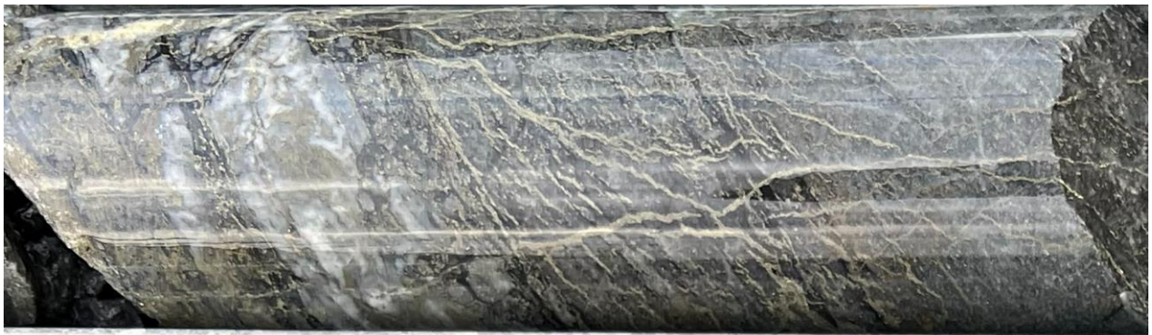
Figure 1 Chalcopyrite and pyrite veining in altered arkose at approximately 291.5 m in RDD 003.

The Company's geologists consider that the mineralisation in RDD003 (and RDD002) is interrelated with the deeper mineralisation in the open pit. This is considered credible due to the extensiveness of the IP anomalies and that historical drilling has generally been too shallow.